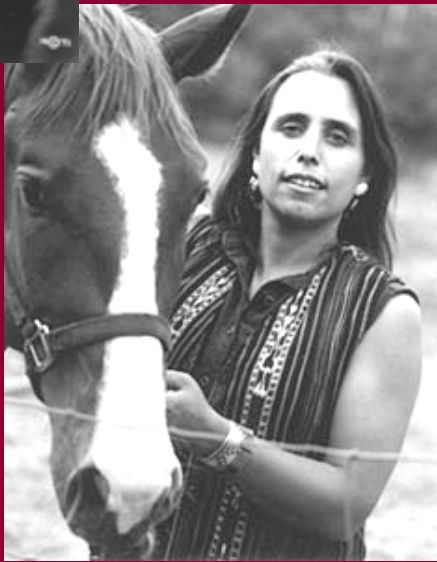
Winona LaDuke (1959 - ) Vice presidential running mate to Ralph Nader on the 1996 and 2000 Green Party tickets and the daughter of an Anishinabe (Ojibwa) father.