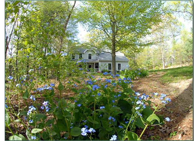
The Norwich Bulletin