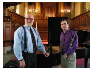
performance of early jazz