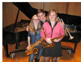
Intercollegiate Band Festival