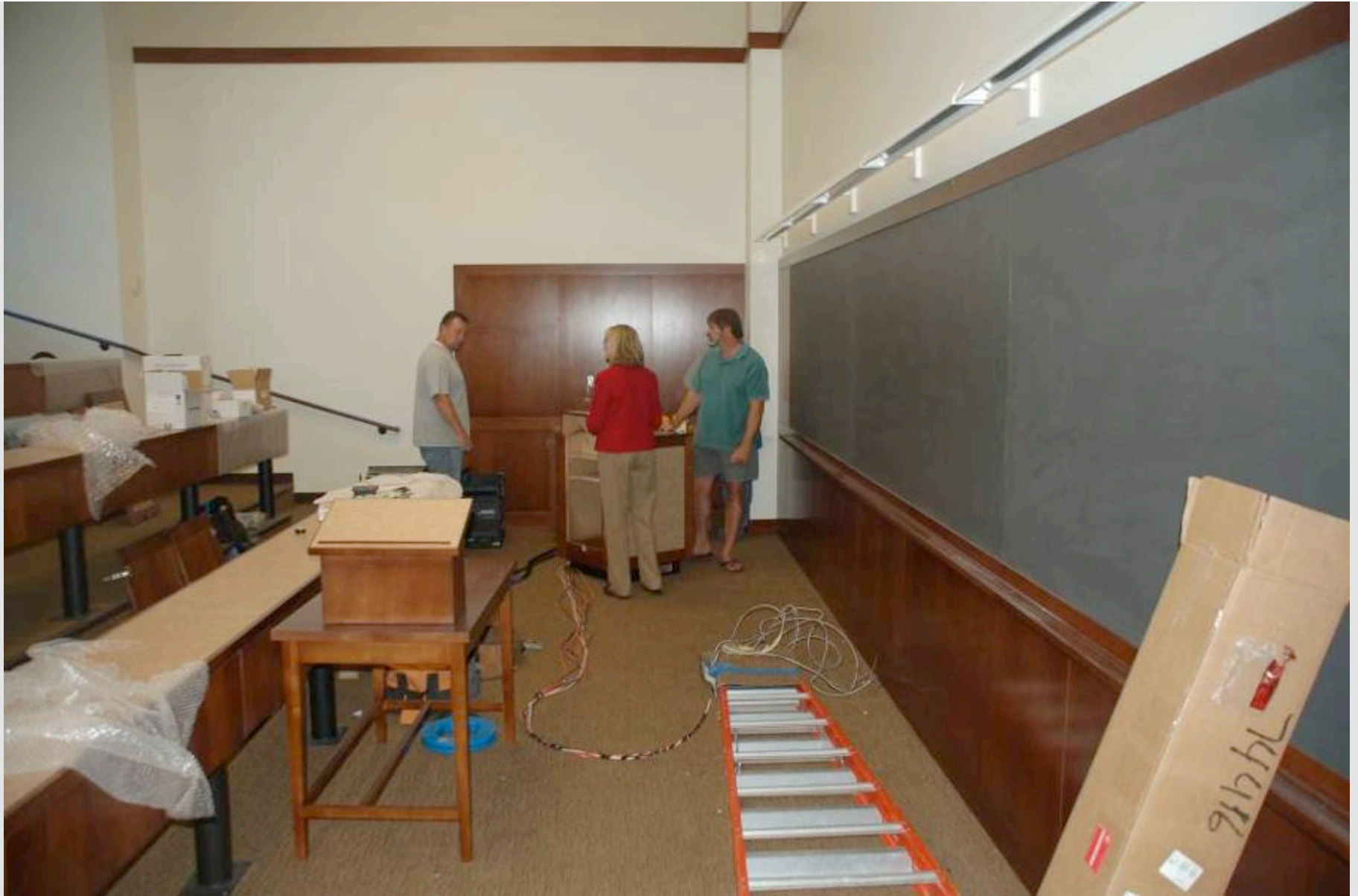
Installing the expanded blackboard with lighting, wood trim, faculty table, projection screen and media lectern