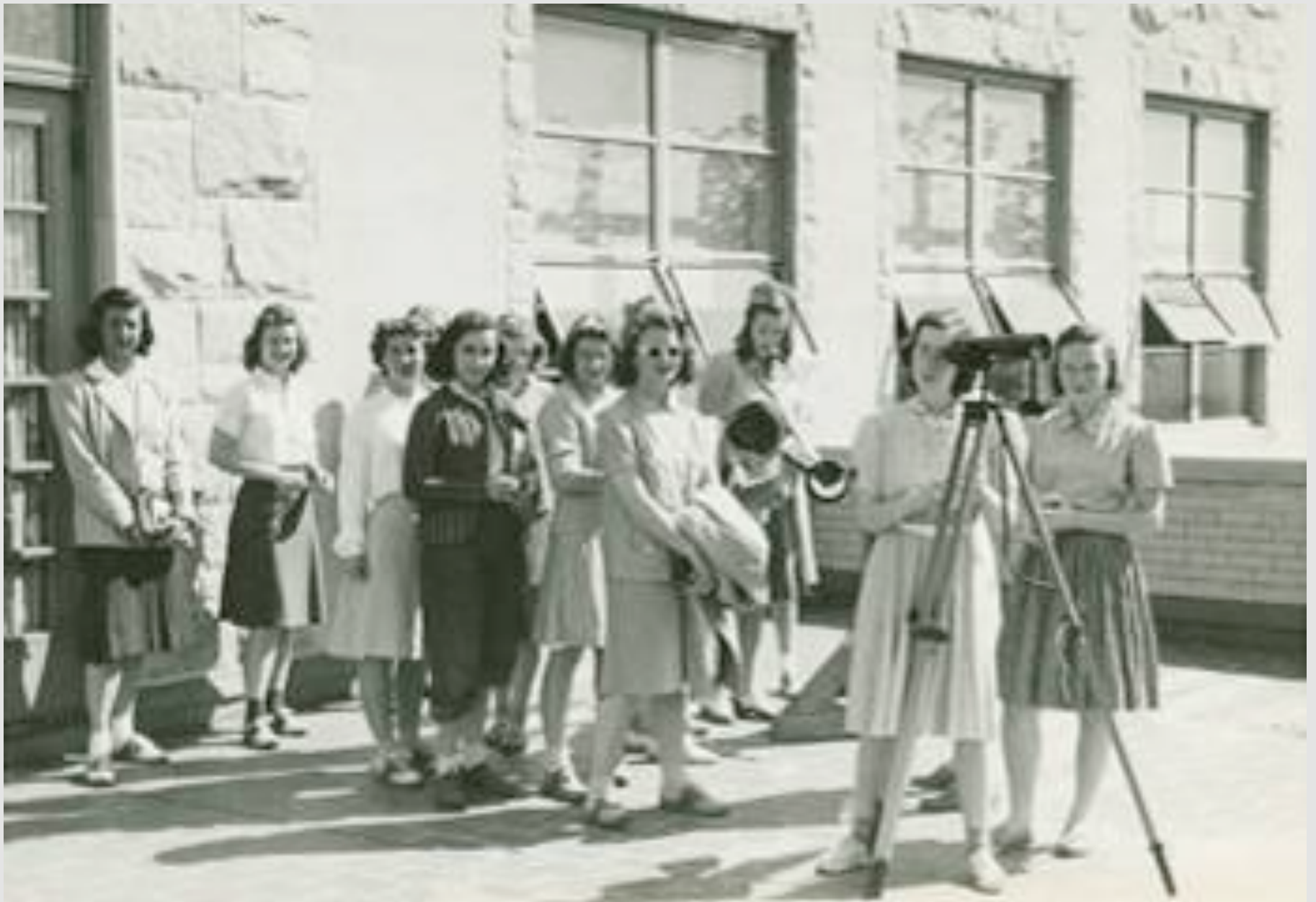
An astronomy class on the roof