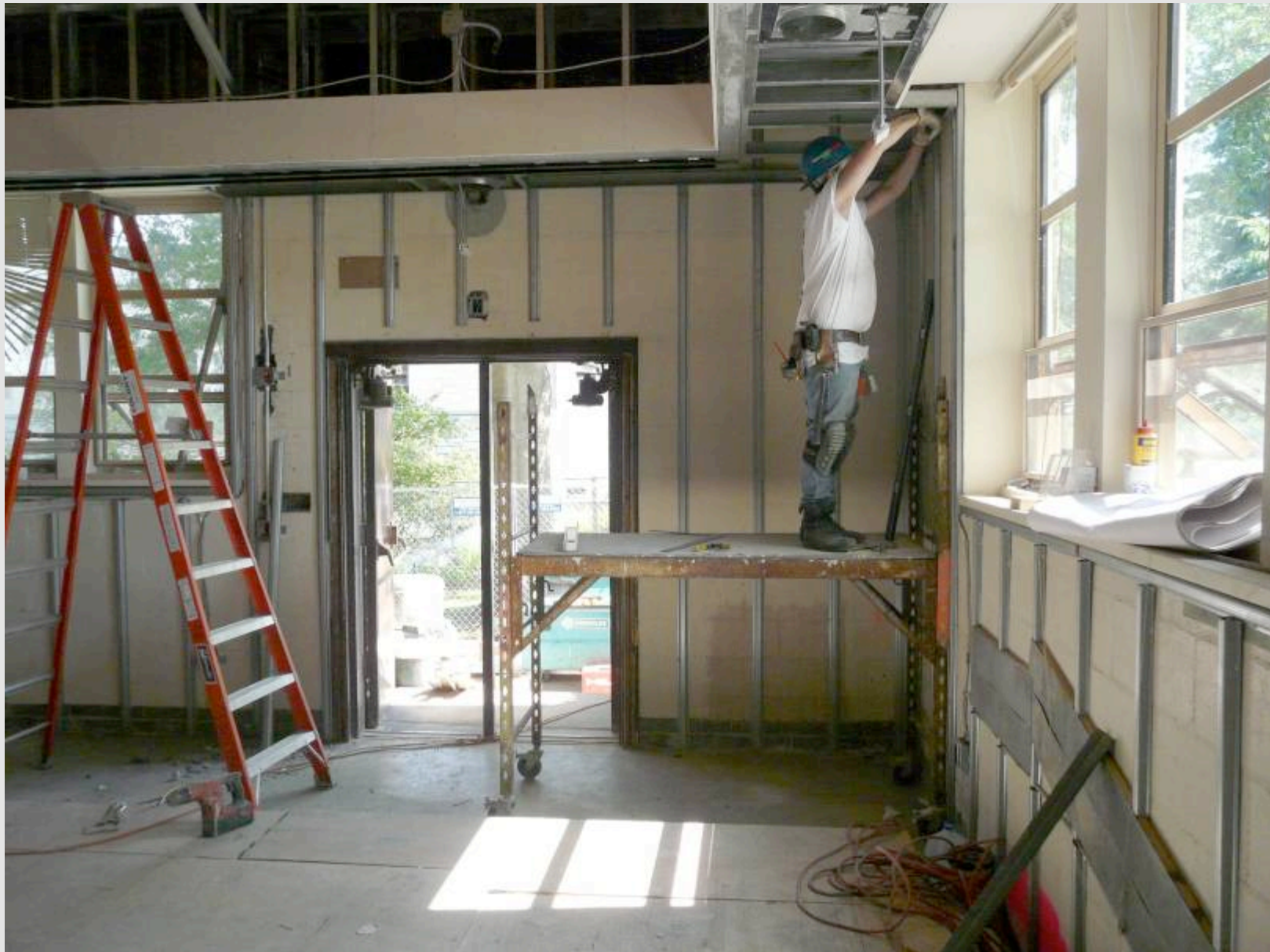
Temporary floor at the back of the room, level with the back door