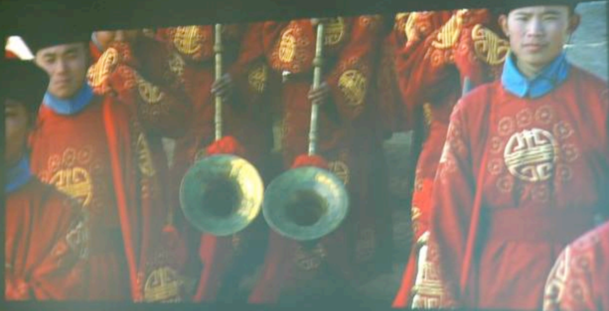
Fiction and Film in Modern China