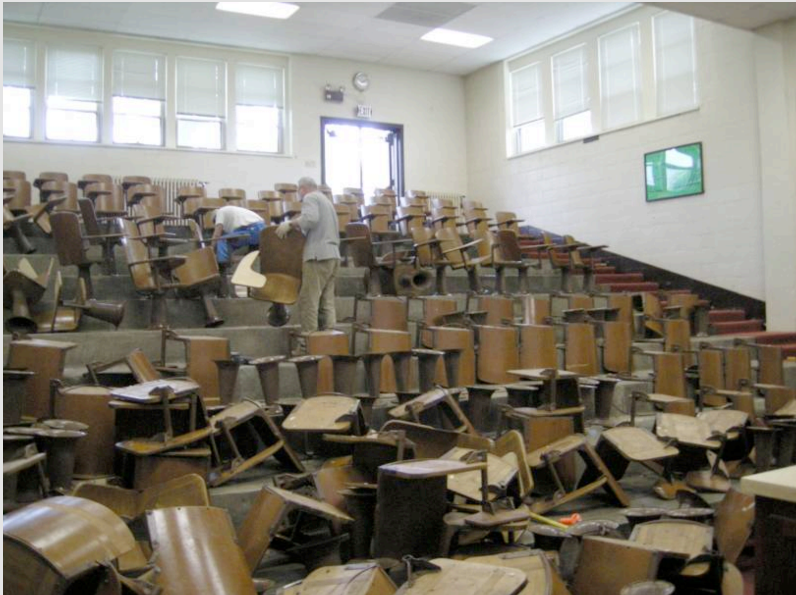
Renovation begins with demolition First, removing the chairs