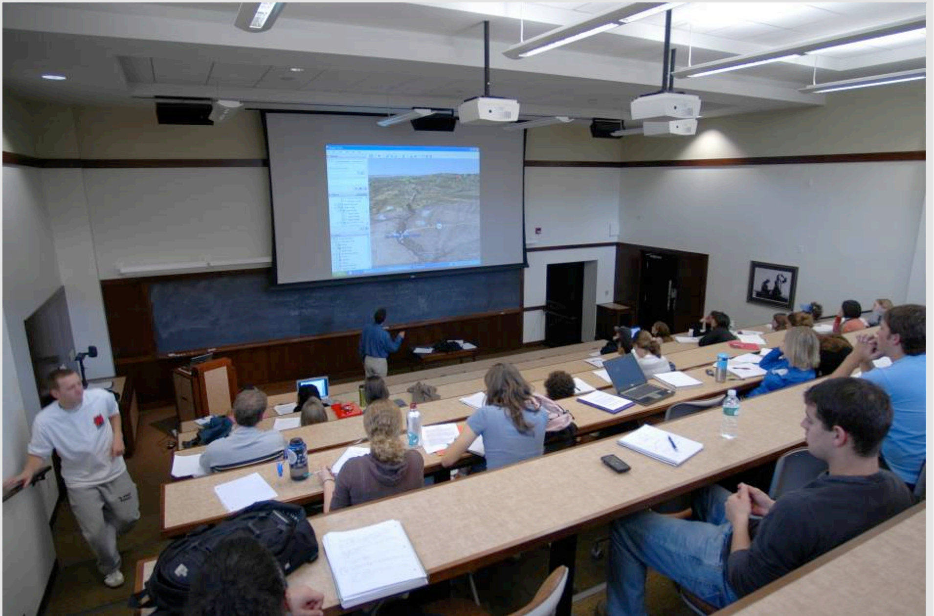
Introduction to Physical Geology