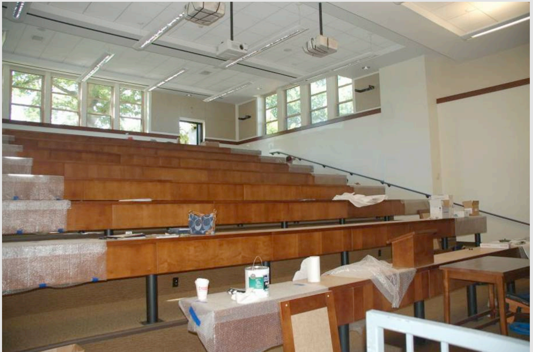
Installing carpeting, student tables, room darkening, projectors, paint and wood trim