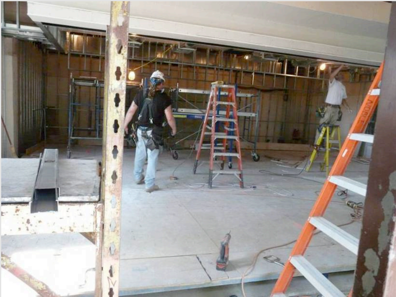
Installing the drop ceiling, projection system mounts and lighting