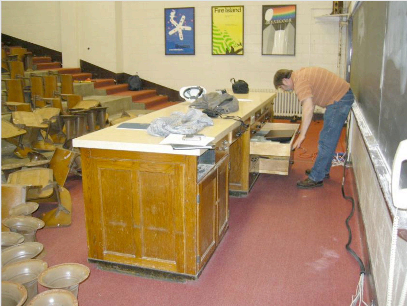
Removing the lab bench