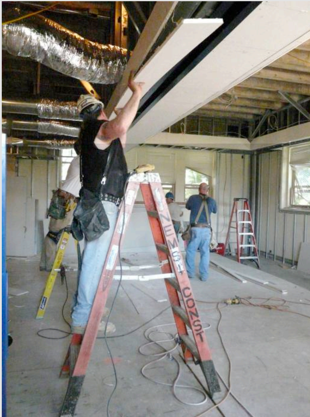
Installing the soffit for the drop ceilings at the back of the room