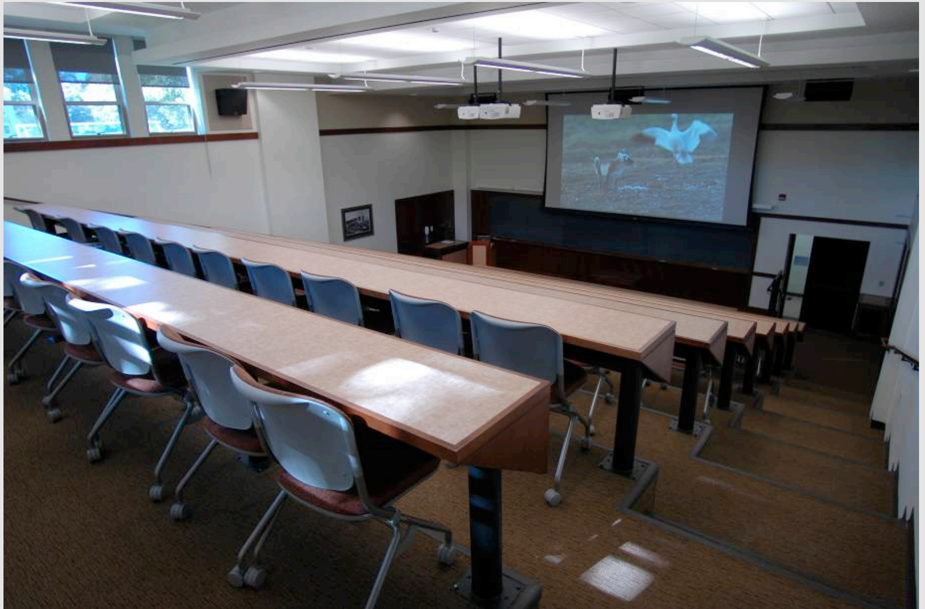
August 2008 Transformation Complete