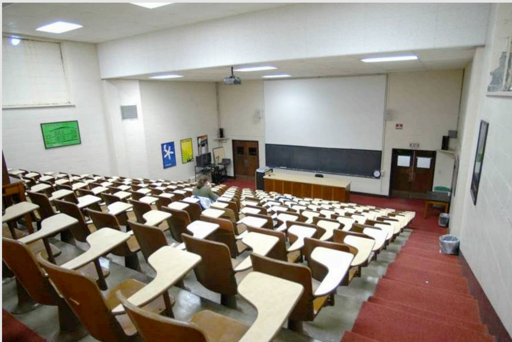
68 years later May 2008 Just prior to renovation