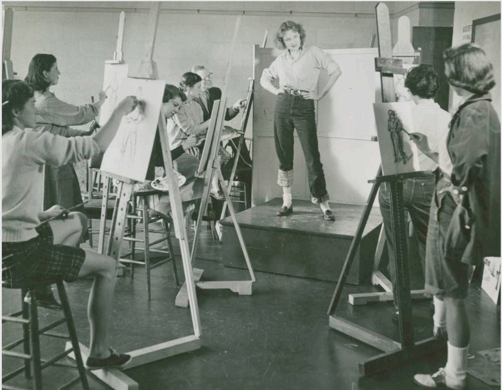
A drawing class