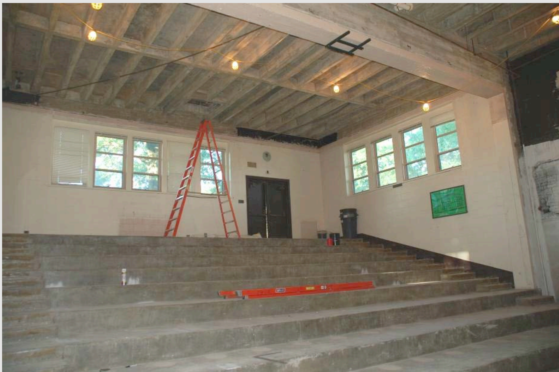
Widening the tiers for student tables