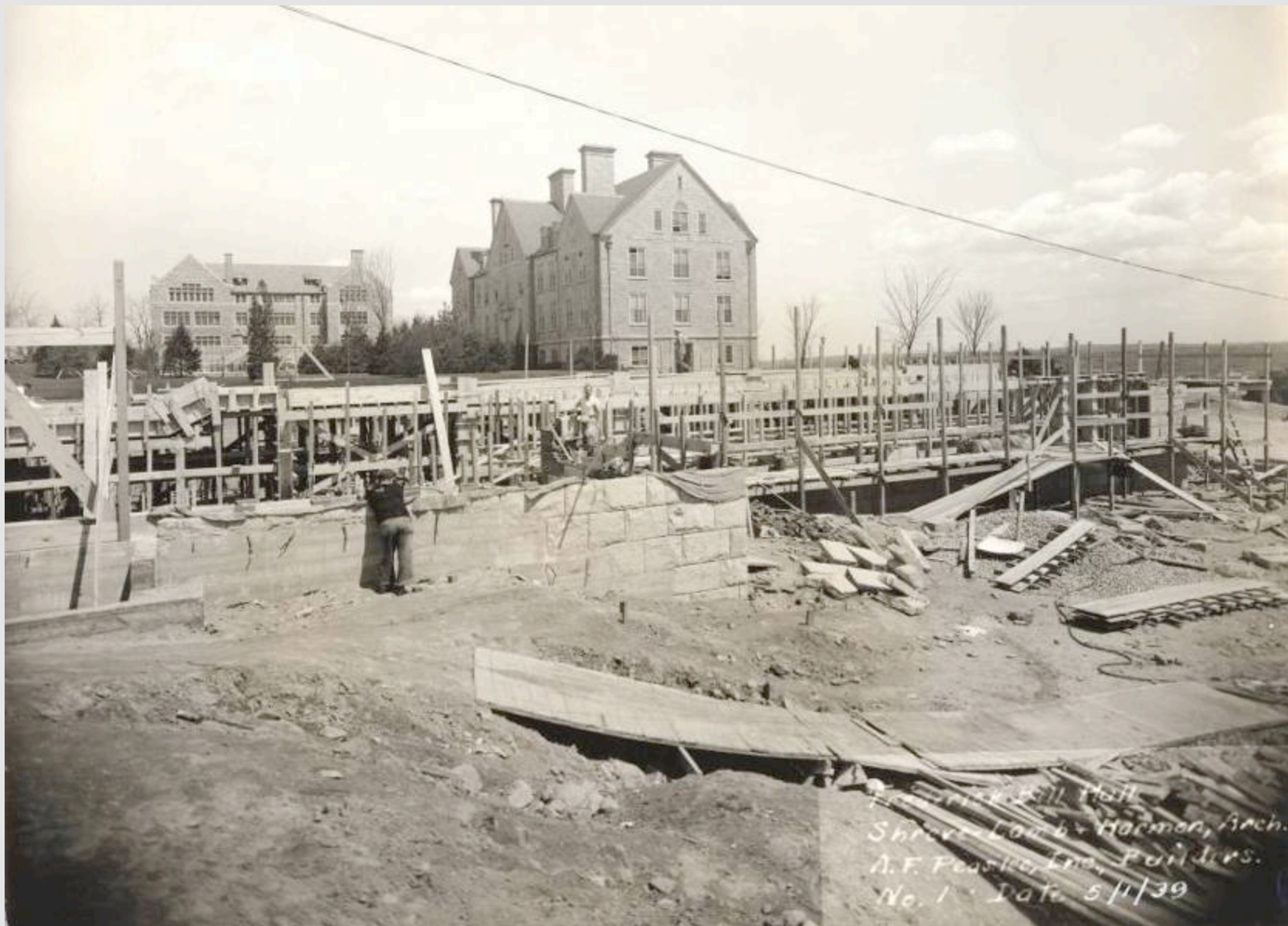
Construction of Bill Hall with New London Hall (left) and Fanning (right) in background