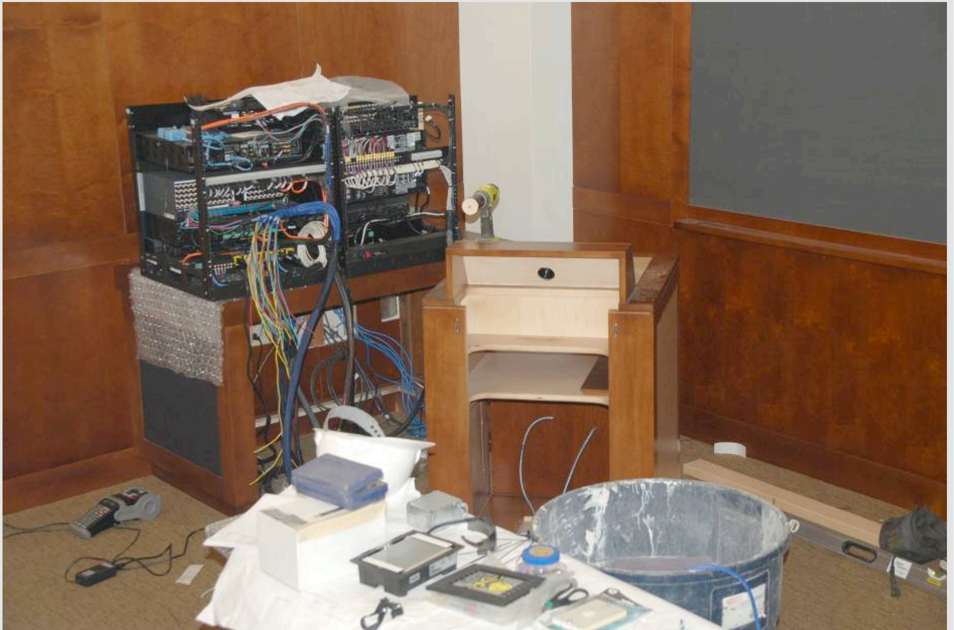
Electronics going into the media cabinet and lectern