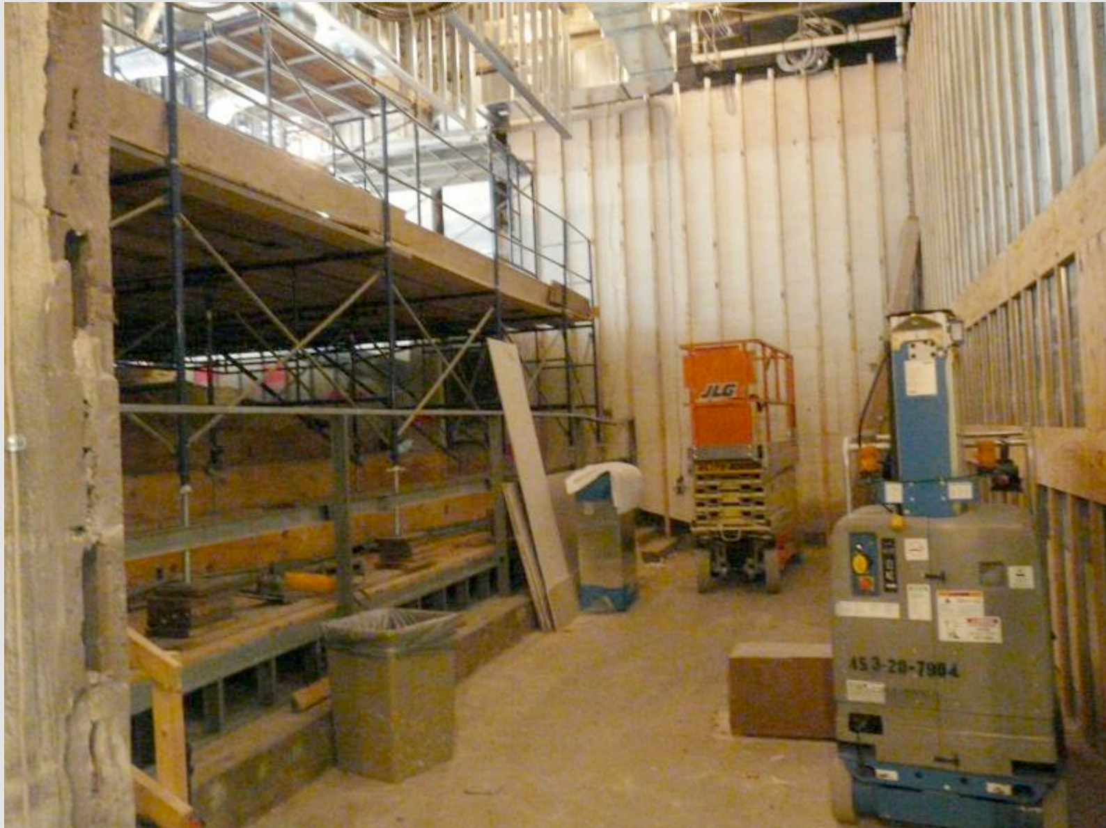
Building a temporary floor to assist construction, 10 feet off the ground at the front of the room