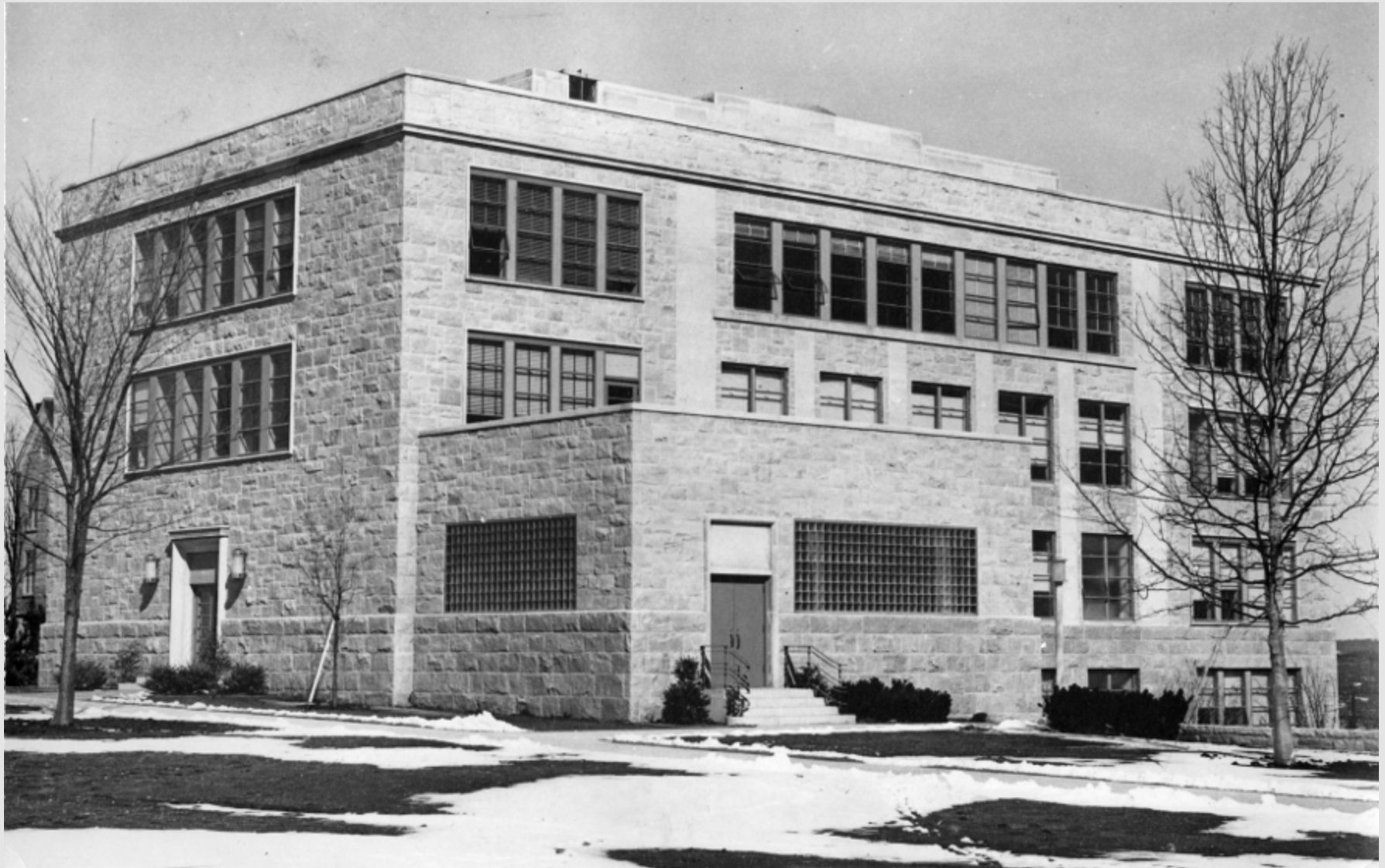
Bill Hall upon completion, viewed from the Green, showing exterior entrance to Bill Room 106 with glass block windows