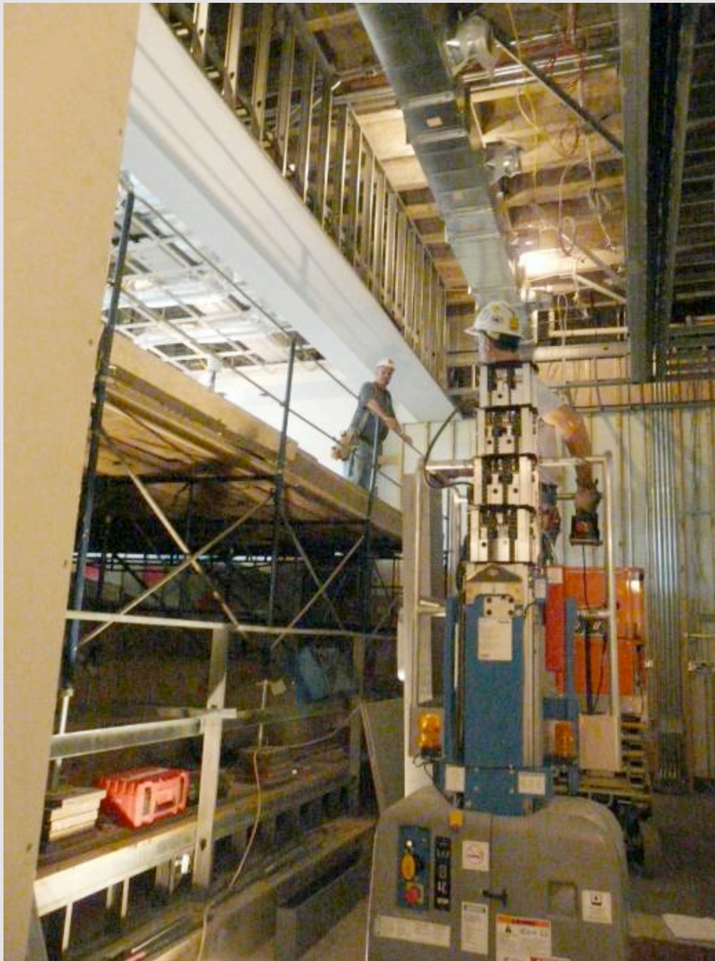
Updating the HVAC system