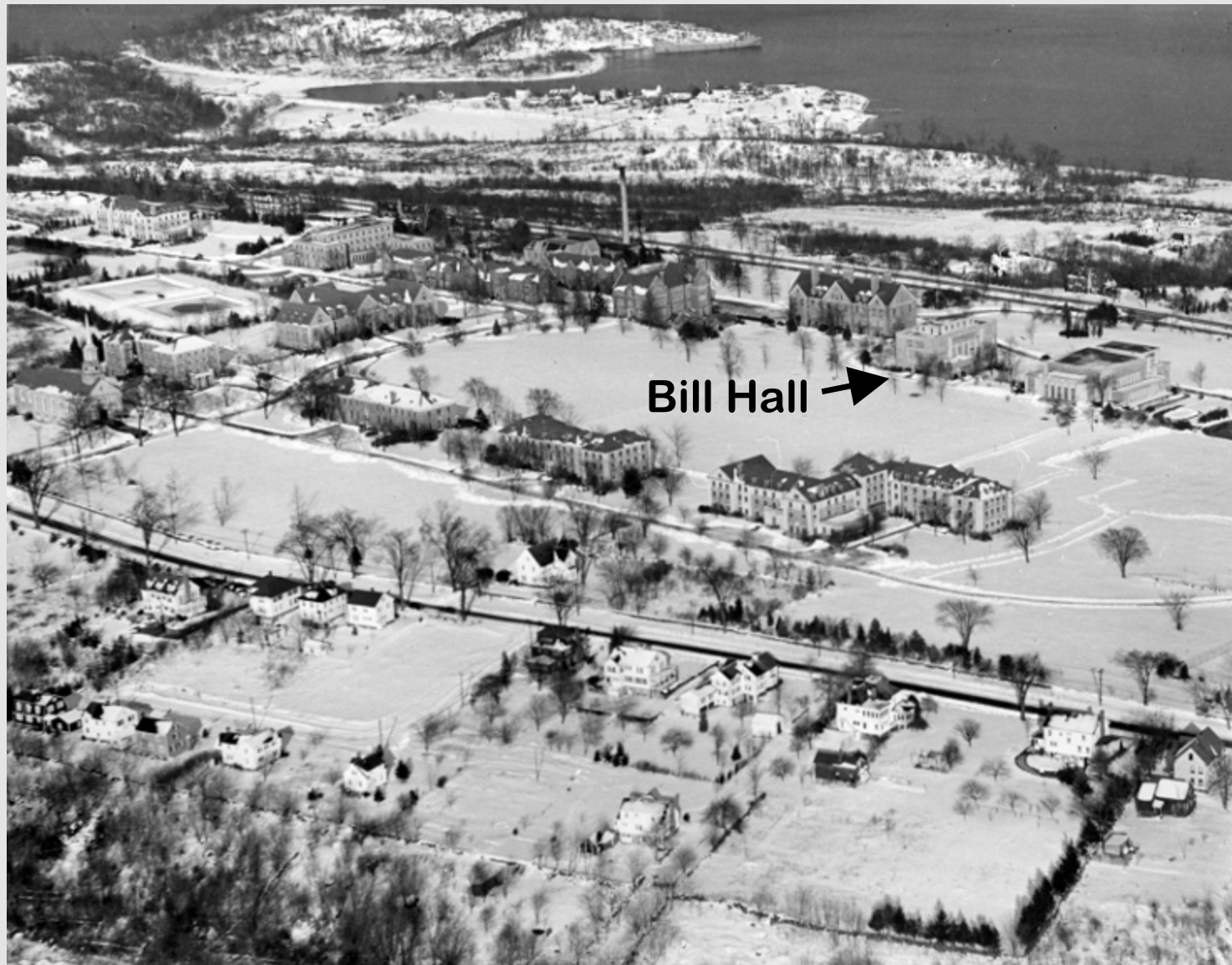
Aerial view of campus including newly completed Bill Hall adding space for Psychology, Physics and Studio Art