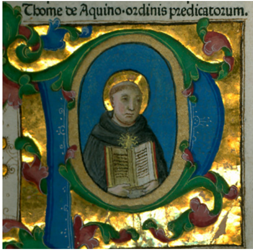
Illuminated initial from the Summa Theologiae , Palmer Collection

Friends receive notices of sponsored exhibitions, lectures and receptions, and the Friends newsletter. Friends who contribute $50 or more will receive borrowing privileges to the Charles E. Shain Library and the Greer Music Library. Those who give over $100 will receive a set of Friends of the Library bookplates, which can be personalized for those giving over $250.