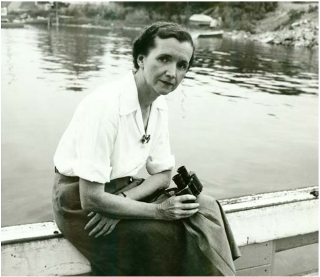
Rachel Carson at Woods Hole in 1950