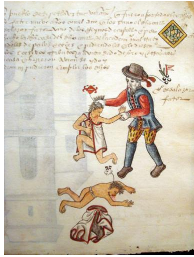
An illustrated manuscript depicting abuses of Indians on a Spanish encomienda