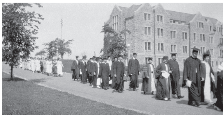
Faculty process at the first Commencement exercises, June 18, 1919.