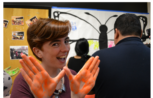
A butterfly mural was made after the conference to represent the 65,000 MA residents who would benefit from Obama's administrative relief.

though I haven't taken any classes related to communications, and have found that I love working here and am learning a lot of new skills that I wouldn't have learned had I chosen a position in another department. If you just find an organization you love, our liberal arts skills will help you adapt to any tasks.