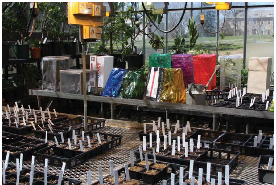
Students' experiments in Biology 105 (Organisms) line greenhouse benches.