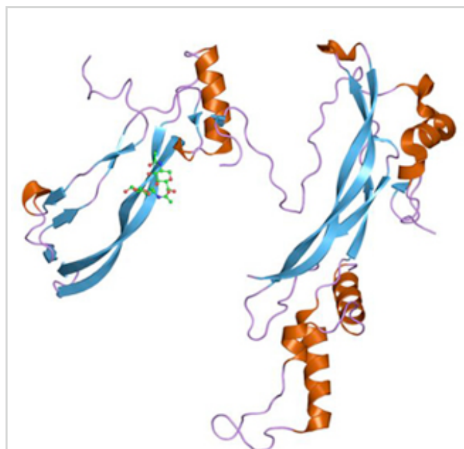
Crystal structure of bone morphogenetic protein 7 (BMP7), the 2011 Molecule of the Year, is depicted in complex with the secreted antagonist Noggin.

All in all, BMP7 is not a new protein. Previous research has shown that it is involved with bone homeostasis and vertebrae development. Furthermore, the Federal Drug Administration has approved its use to aid bone repair during surgical procedures.