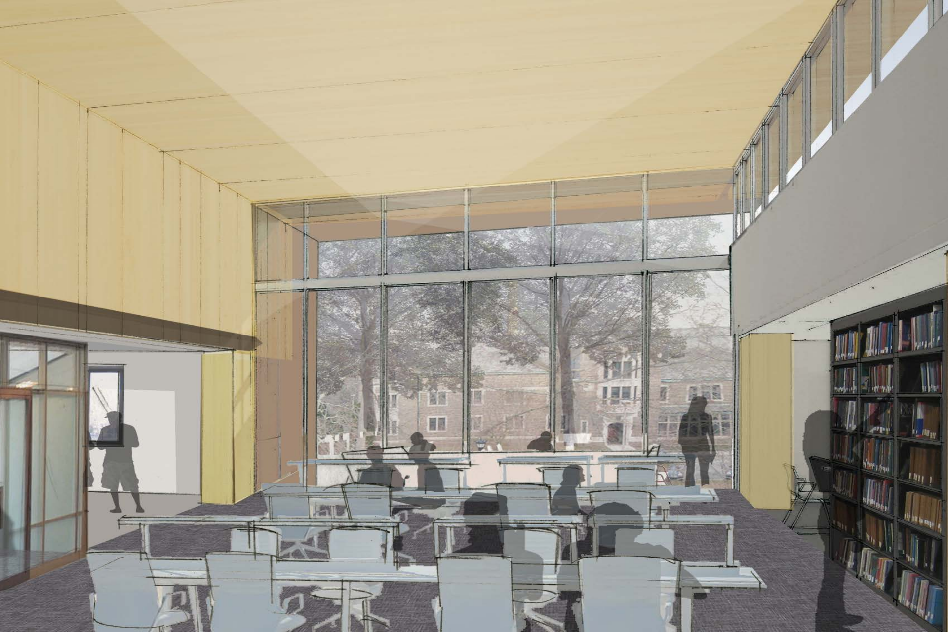
Natural Light -- Third Floor Reading Room