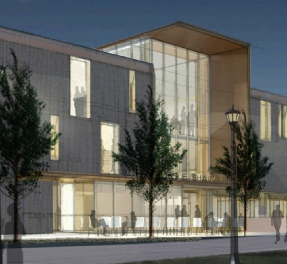
CHARLES E. SHAIN LIBRARY