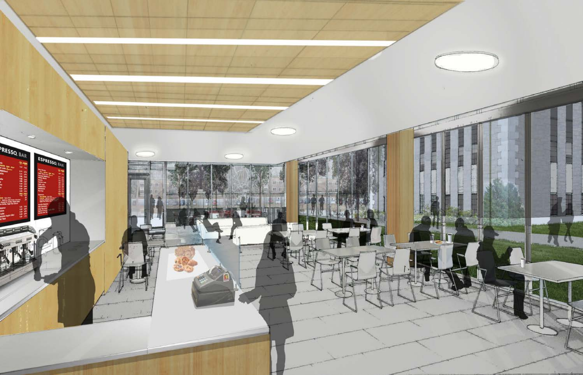
Blue Camel Café and 24 Hour Study